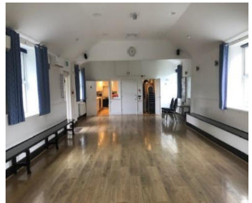
The Hall showing the new kitchen end

Their contributions were celebrated at a party in October.