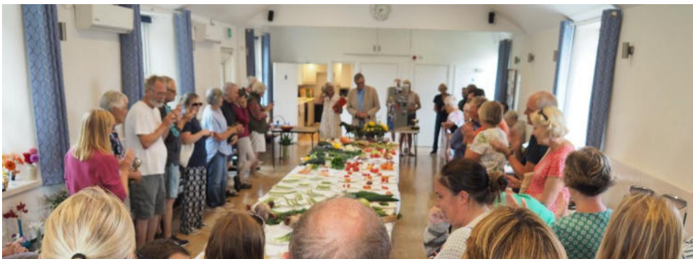
Produce Show prize giving